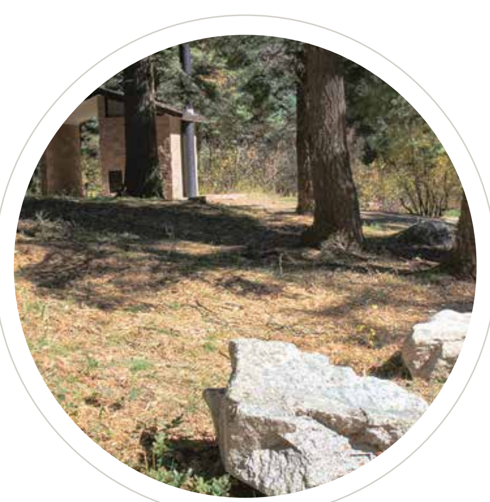
LEFT TO RIGHT These photos were taken before and after thinning. The orange ribbons on the trees at left are the planned leave trees. Can you find the building in the photo taken before the thinning? Thinning removes the overgrown trees that act as fuel for wildfire.