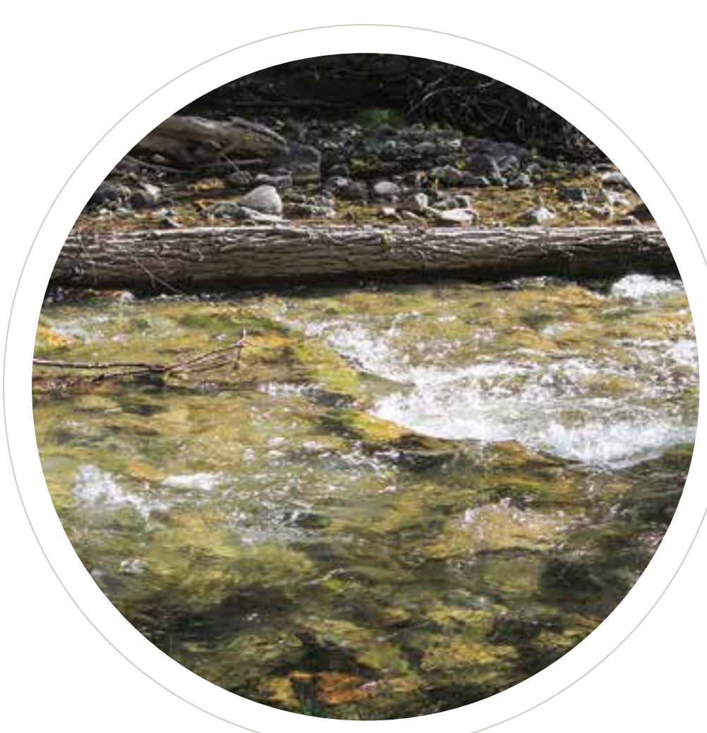
LEFT TO RIGHT Winter snowpack brings high stream flow in the spring. Flows recede in the summer, increasing for short periods after thunderstorms.