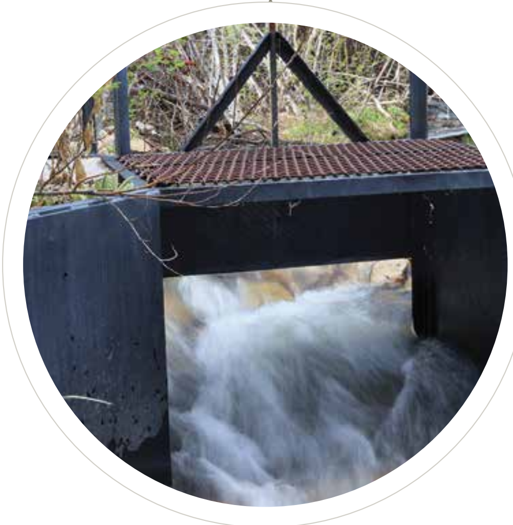
CLOCKWISE A few miles downstream is the community of Valdez, where farmers use water from the Rio Hondo to irrigate fields. Acequias to carry the water were built centuries ago, using hollow logs and hand-dug ditches.